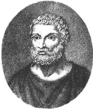
• Mileto , Bishop of Sardis, around AD 175

Various bishops developed lists of inspired books: