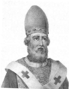
• Pope Damasus in AD 382, prompted by the Council of Rome, wrote a decree listing the present OT and NT canon of 73 books.

• The Council of Hippo (in North Africa) in AD 393, approved the present OT and NT canon of 73 books.