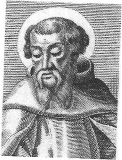
• St. Irenaeus , Bishop of Lyons, AD 185