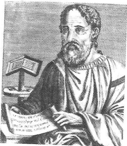
• Eusebius , Bishop of Caesarea, around AD 325